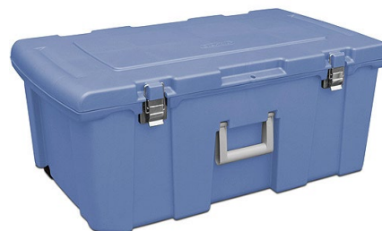
Sterilite Footlocker 31.125 x 17.5 x 13.875 Available: Amazon (doesn't fit under all bunks)