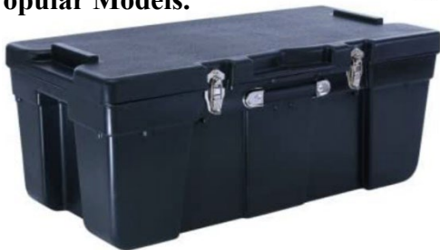
J. Terence Thompson 32-1/2 x15-3/4 x13-3/4 Available: Amazon