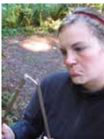
Check for Broken Poles