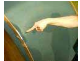
Inspect for Rips